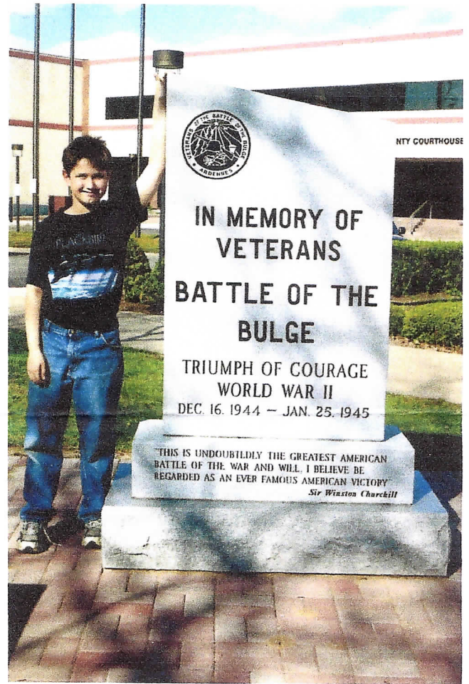
This is the Battle of the Bulge Memorial in front of the Marathon County Courthouse in downtown Wausau, Wisconsin.